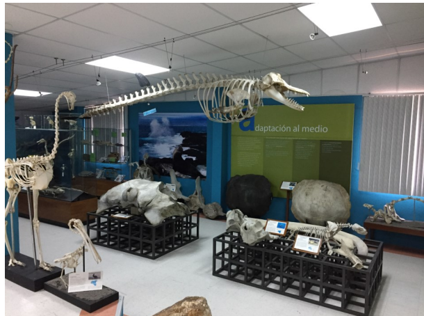
Area of collections at INABIO.

The accompaniment and monitoring of the project will be done through an inter-institutional committee that will verify the compliance of each of the involved and the results obtained.