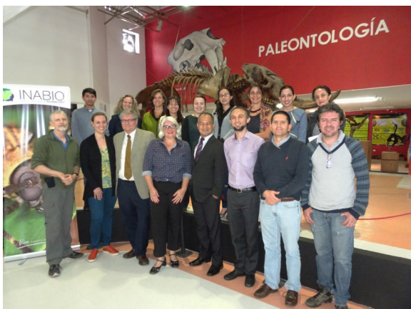
Left picture: planning workshop with the leaders of the project INABIO.

The Brazilian contribution is dedicated to the assignment of analysts of the Brazilian Cooperation Agency (ABC), Brazilian